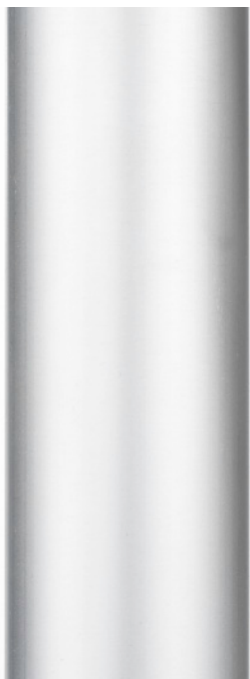
2" DIAMETER POLE

Stainless steel bolts and reinforced grommets secure the canopy and prevent fabric tearing. A commercial grade easy gliding double pulley and pin system (not push up), marine grade corrosion resistant aluminum frame with stainless steel hardware, and a modular construction add to the resilience of this already superior umbrella.