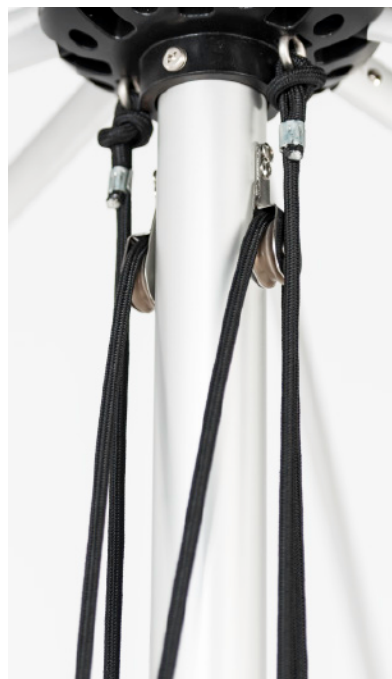
COMMERCIAL DOUBLE PULLEY SYSTEM