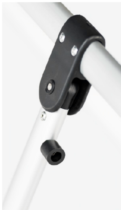
HIGH IMPACT RESIN JOINTS