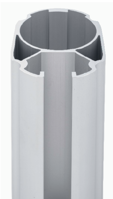
EXTRUDED ALUMINUM MAST

Heavy gauge aluminum and stainless steel parts on a marine grade corrosion resistant aluminum frame ensure the Eclipse is ideal for all environments.