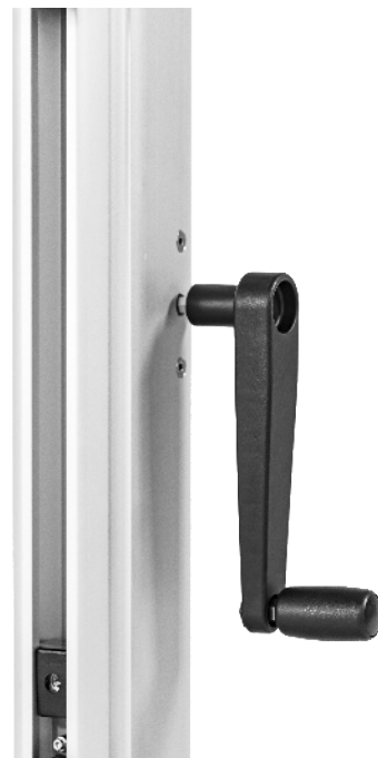
SILENT CRANKING SYSTEM