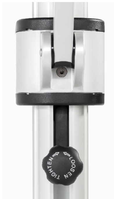
INFINITY TILT SYSTEM