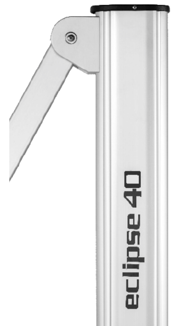
EXTRUDED ALUMINUM JOINTS